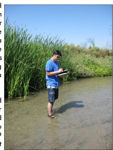
Santa Ana Sucker Habitat Survey

Pursuant to the Basin Plan and the Watermaster/IEUA permit to recharge recycled water, Watermaster and IEUA have conducted groundwater and surface water monitoring programs since 2004. During this reporting period, Watermaster measured 414 manual water levels at private wells throughout the Chino Basin, conducted two quarterly downloads at the 43 wells containing pressure transducers, collected 49 groundwater quality samples, 154 surface water quality samples, and 40 direct discharge stream measurements. Quarterly Surface Water Monitoring Program Reports that summarize data collection efforts were submitted to the RWQCB in July and October of 2010.