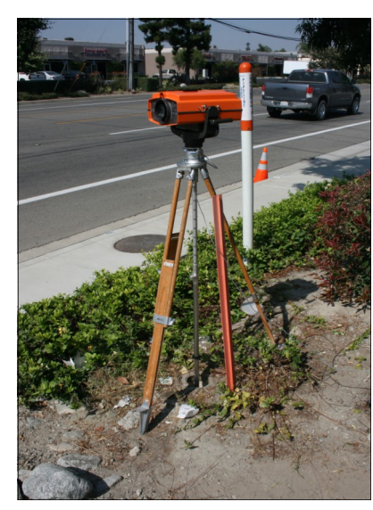
MZ-1 Monument Construction & Surveying

The continuation of detailed water-level monitoring at wells within the Managed Area and at wells in central MZ-1. Replacement of water-level-recording transducers at wells