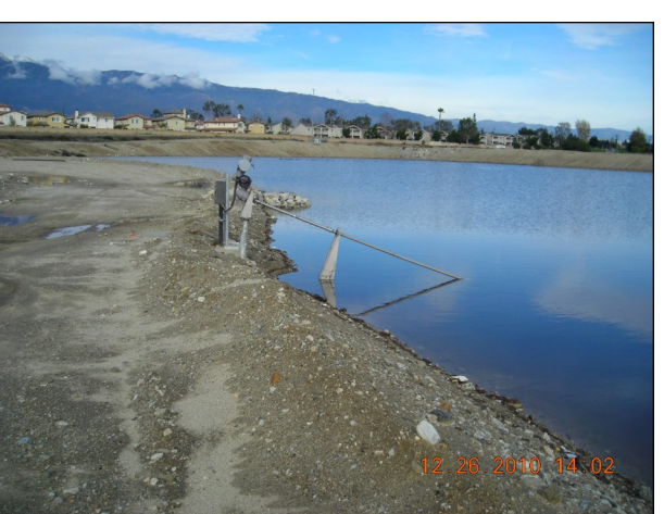
December Storm at Victoria Basin