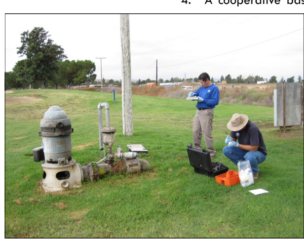
Watermaster field staff collecting samples for water quality monitoring

Water Quality and Quantity in Recharge Basins. Watermaster measures the quantity of storm and supplemental water entering the recharge